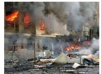
Pentagon after attack