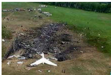
Flight 93 in PA