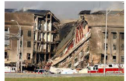
Pentagon after attack