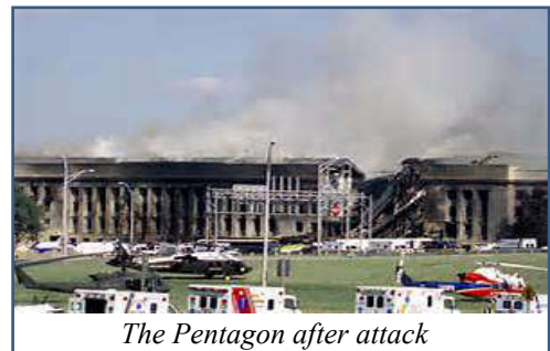
The Pentagon after attack