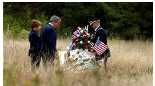
President & Mrs. Bush at the PA site of 9-11