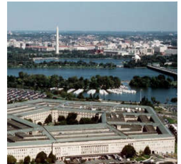
Pentagon before attack